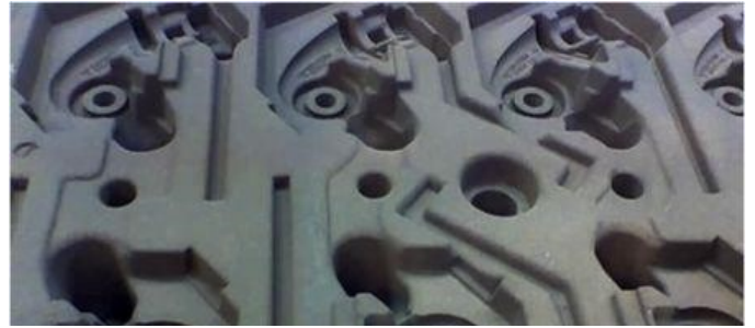
Multiple cavity turbocharge housing mould